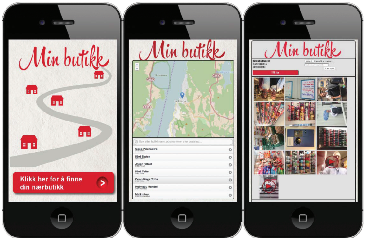
Prototype 1: Screenshots showing the main pages of the app enabling the sharing of text, images and video to a local store.

find store on the map screen and lastly the screen where you can watch what other people have uploaded and contribute text, images or videos yourself.