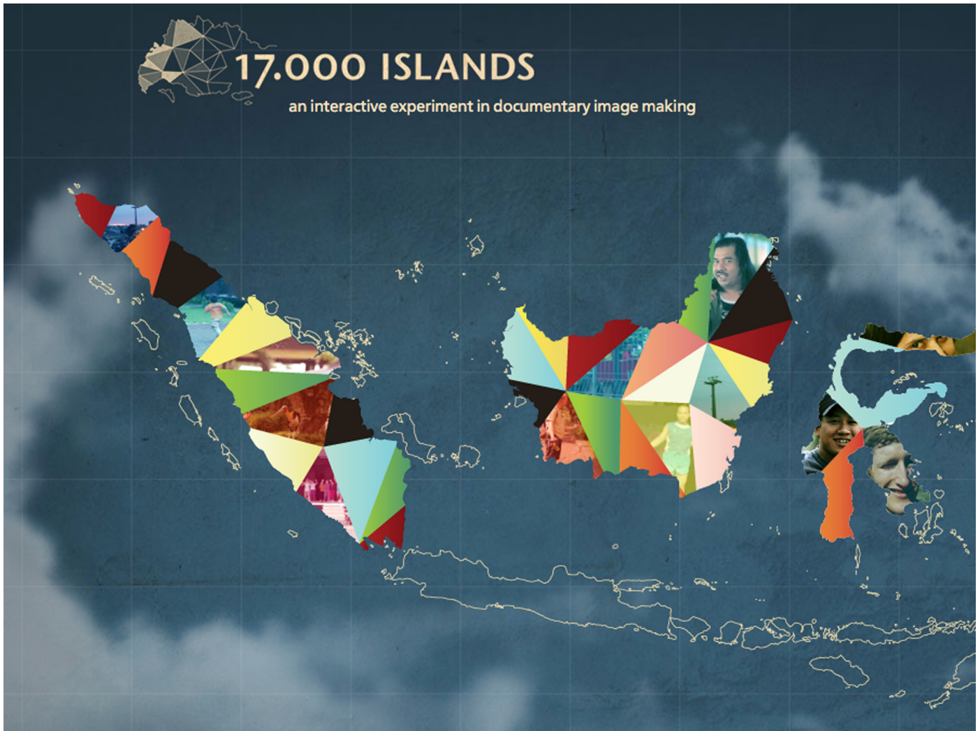
Project 1: The landing page of the project 17000 Islands, affording the possibility of 'sculptural editing'.

findings from an interview study with independent documentary producers in Norway undertaken in 2012/2013 and from participating in a non-fiction transmedia project, where I contributed as a full member. In the discussion, I will highlight the implications of these findings for independent documentary film practitioners wanting to make non-fiction transmedia and for the institutions aiming to support them.