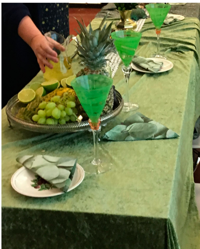
Figure 2. Feminist feast.

and the guest slowly crossed the threshold, they let go one another's hands and became silent. But the silence was sweet, for in spirit they still held hands and were still singing. (Blixen, 1965, p. 54)