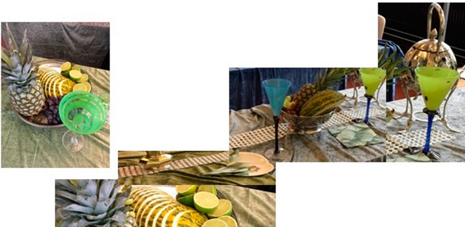
Figure 1. Feminist Feast.

As Babbette's red-haired familiar opened the door to the dining room