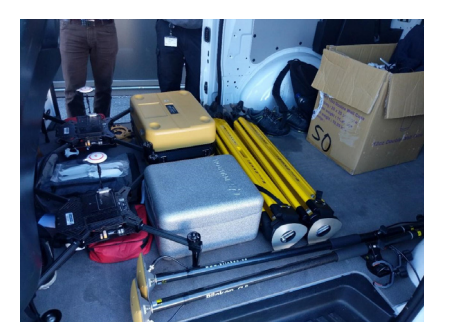
Figure 2: DJI Matrice 100 and other equipment used for UAV-assisted inspection.

V2.0) and remote controllers, landing platform, Zenmuse Z3 camera (an integrated aerial zoom camera with 7X zoom capacity), GPS antenna and handheld, total station, tripods, spare batteries, blades, iPad and connection wires to drone remotes, helmets, safety boots and reflective jackets, tapes and markers.