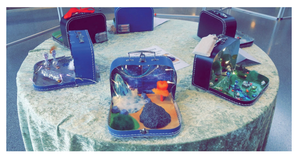
Image from the Storyline Where good and evil forces fight for power which shows the boxes that the students made for storytelling.