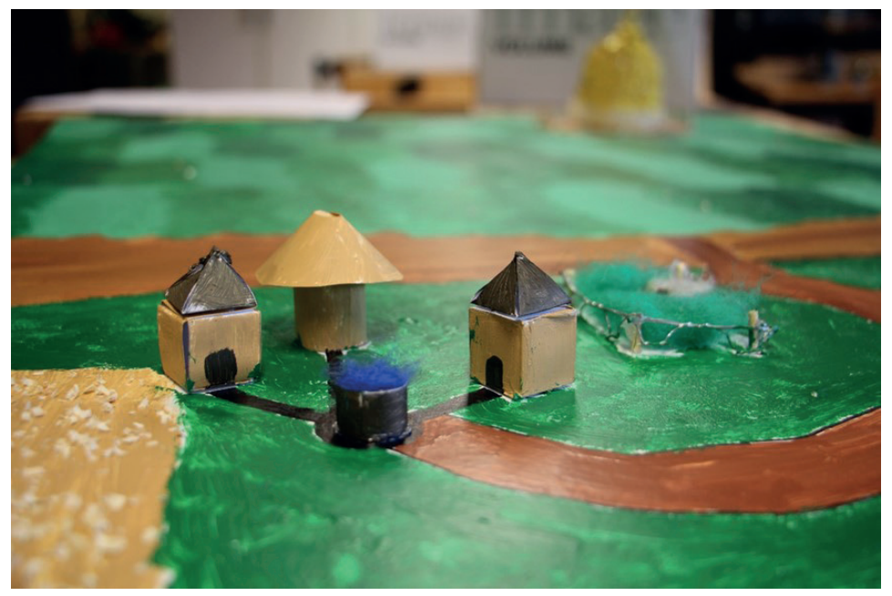
Fig. 2: An example of visual representation of a "location" in a Storyline named The Fairy-tale Forest, implemented at Østfold University Collage.