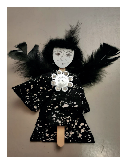
Fig. 3: One of the creatures made, from The Fairy-Tale Forest Storyline discussed in chapter 8.

of challenge, while at the same time offering a low level of threat" (p. 152). Following the work of Heathcote (1991) the teacher's role is to create the conditions that support learners taking on roles as experts in an imaginary enterprise. Heathcote (1991) stresses that the purpose is not to get totally involved in the imagined world, but to bear in mind both the fictional world and the reality of the learning context (see also Boal, 1995).