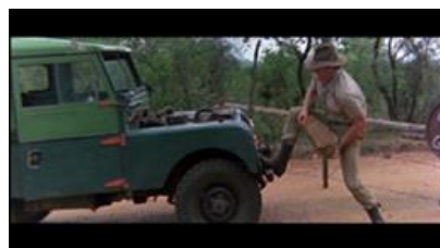
Figure 4. Creative writing