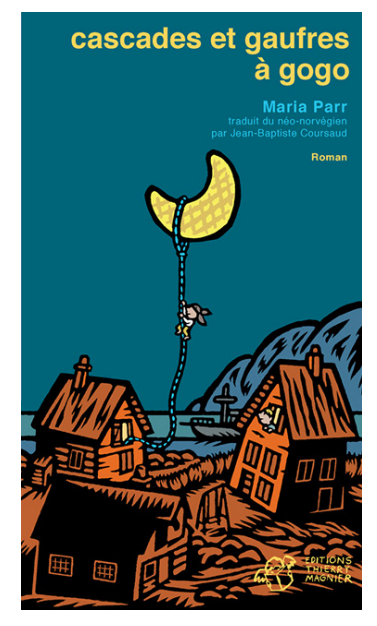
Image 2. Cover of Cascades et gaufres à gogo by Maria Parr © Thierry Magnier, 2009, 2014. Cover image by Mathis.