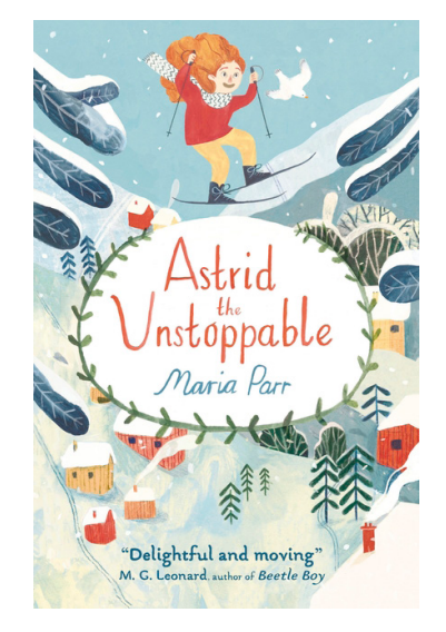
Image 7. Cover of Astrid the Unstoppable. Copyright © 2009 Det Norske Samlaget, Oslo. Title by Maria Parr © Det Norske Samlaget. Cover/Jacket and Chapter illustrations © 2017 Katie Harnett. Translation © 2017 Guy Puzey.