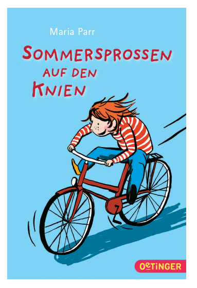
Image 5. Cover of Sommersprossen auf den Knien, © Oetinger Taschenbuch, Hamburg. Cover image by Heike Herold.