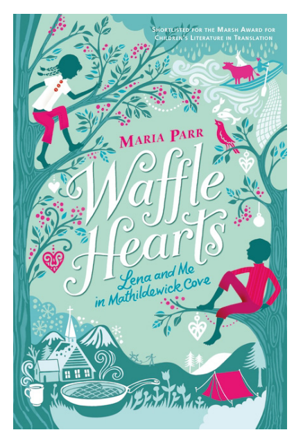
Image 3. Cover of Waffle Hearts . Copyright © 2009 Det Norske Samlaget, Oslo. Title by Maria Parr © Det Norske Samlaget. Jacket/Cover Illustration and Chapter Headings © 2013 Kate Forrester. Translation © 2013 Guy Puzey.