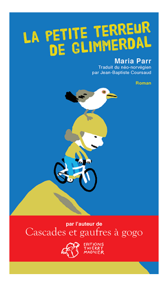
Image 6. Cover of La petite terreur de Glimmerdal by Maria Parr © Thierry Magnier, 2012. Cover image by Mathis.