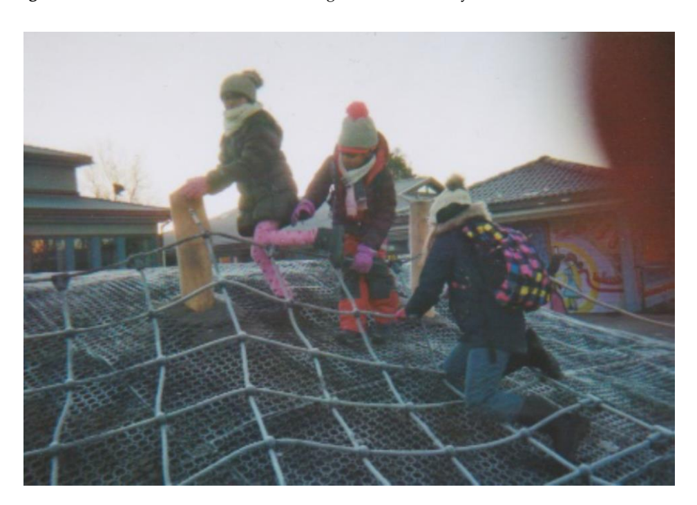
Figure 2. The Heap.

For the adult participants, the Heap was spoken of in terms of a symbol of the social engagement and level of co-creation between school employees and parents. The school contributed money for the materials, but most of the digging and building was done by parents and neighbors in their spare time: