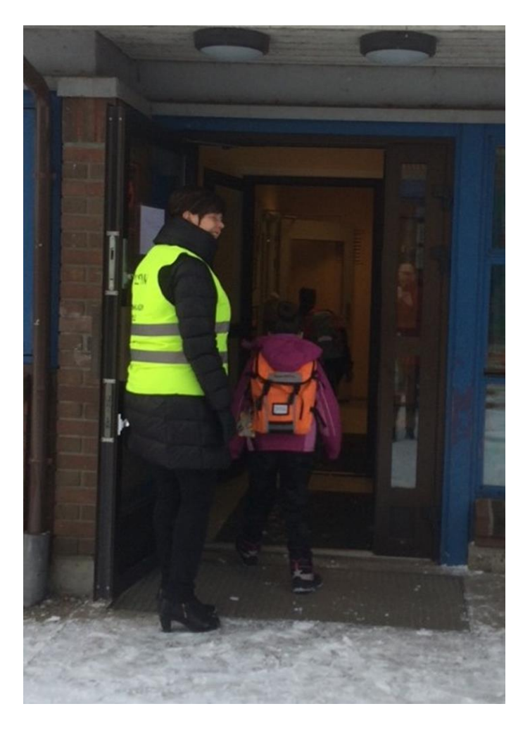
Figure 4. Principal greeting pupils every morning.

The school employees discussed the organizational and work environment that gave them room to experiment and where they felt safe to share their opinions. They also felt that the school's long-term approach of inclusion and equity had built a safe environment for the pupils and the parents: