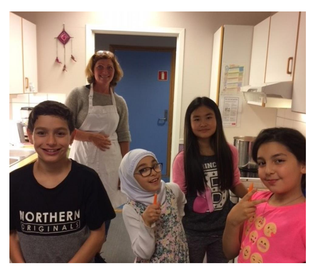
Figure 3. At the school kitchen.

The commitment of earlier and current principals to physically open the school as a community arena was highlighted as an important premise for its successes.