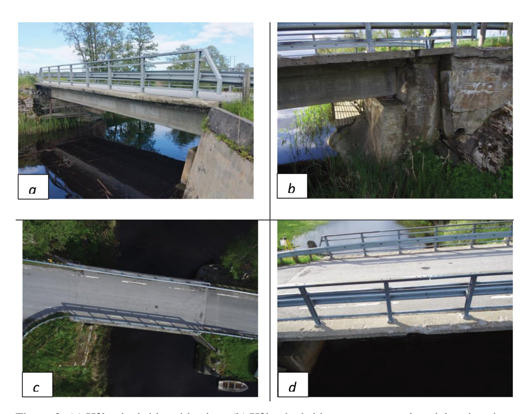
Figure 3: (a) Håkenby bridge side view; (b) Håkenby bridge concrete crack and deterioration; (c) Håkenby bridge top view; (d) Håkenby bridge deck slab damage

avoid obstacles or simply hold altitude in a GPS-denied environment. Other equipment's used are DJI Phantom 4 Pro V2.0, DJI remote controllers, landing platform, GPS antenna & handheld, total stations, tripods, spare batteries, blades, I-pad & connection wires to drone remotes, safety helmets, safety boots & reflective jackets, and tapes & markers. Figure 3 illustrates the level of details obtained from the drone-enabled imaging for Håkenby bridge.