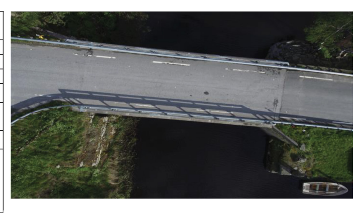
Figure 2: Top view of Håkenby bridge.