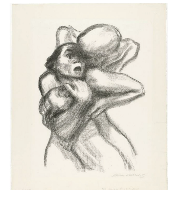
FIGURE 7. Käthe Kollwitz: 'Death Seizes a Woman' from the series Death, 1934