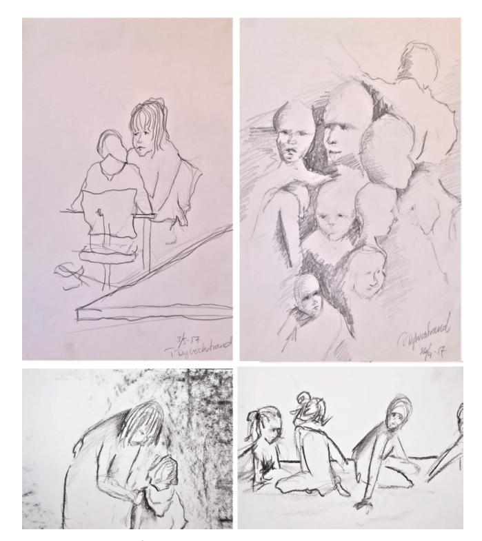
FIGURE 5. Sketches from 2nd Grade, 2017

The interpretation process has the purpose of knowing the phenomenon it is interpreting. This is a question of knowing the phenomenon differently than understanding the phenomenon. To understand is to analyse and break up the experience, while to know is to synthesise the phenomenon into a unit. It is through human practice that, by active engagement, we can get to know ( 'kennen' ) a phenomenon (Cassirer, 1994). Dilthey (1914–1924, p. 10; our translation) has expressed the distinction between understanding and explaining, saying, '[w]e explain [ erklären ] nature, we understand [ verstehen ] the human being [ das Seelenleben ]'. Cassirer goes a step further and differentiates between ' kenntlich ' and ' verständlich '. Understanding something, or ' verstehen ', is something we are able to do as a viewer. On the other hand, knowing something, or ' kennen ', is a synthetic intuition only experienced by a participator in practice.