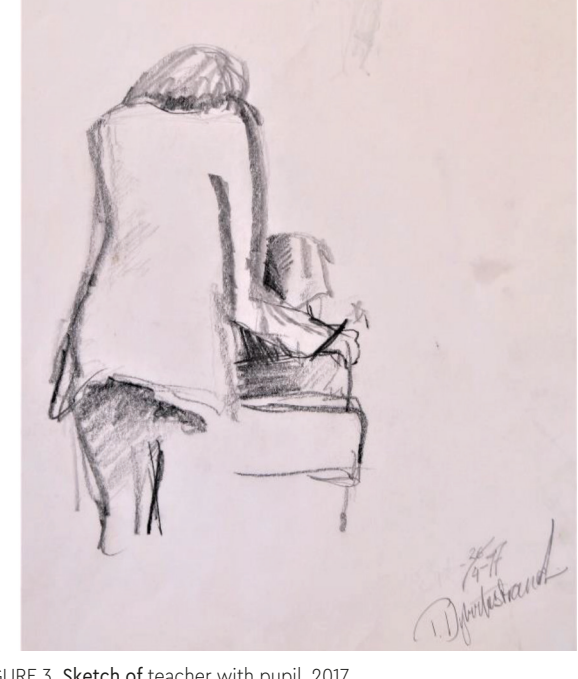
FIGURE 3. Sketch of teacher with pupil, 2017

For the visual researcher, drawing is not only a tool, but a way of understanding the world, sometimes even a way to exist in the world. When the visual researcher entered the classroom to observe the teacher's action, the perception and experience of