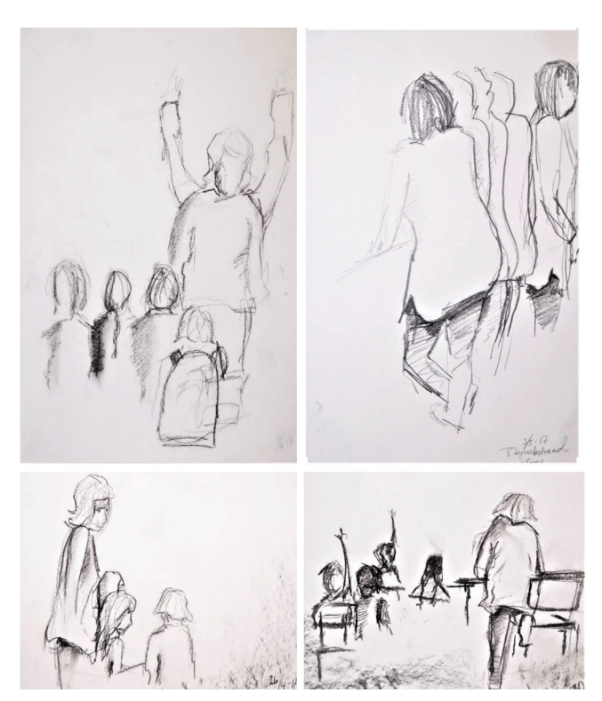
FIGURE 4. Sketches from 4th Grade, 2017

we use our ability to make analytic assumptions. This part of our cognitive ability gives us an understanding and explanation of the cultural phenomenon. The third and final layer, the iconological, is also called 'intrinsic meaning'. It is a unity of the first two layers, but it also consists of something more. This additional interpretation is the context and the interpreter's interaction with the phenomenon. Panofsky (1972, p. 8) points out that '[i]n thus conceiving and pure forms, motifs, images, stories and allegories as manifestations of underlying principles. we interpret all these elements as what Ernst Cassirer has called [symbolical form]'. Panofsky's expression of Cassirer's phrase symbolic form is 'symbolical values'. The philosophical term 'form' is connected to Aristotle's and Plato's concept of essence, or what the phenomenon is. Cassirer (1966) is critical of the (empirical) scientific banning of Aristotle's 'dark qualities' of form.