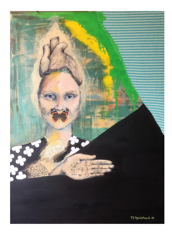
FIGURE 9. Thousands of choices every day

Verbal writing as a form of art can be manifold. In our case. we use narratives to describe a phenomenon and give thin descriptions to try to capture the essence of small dramas that unfold in the classroom and provide understanding and some salient and remarkable features for the phenomenon. We use pedagogical theory to orientate the reader about the essence of teaching. To create a better understanding of the teacher, we present the teacher's own voice. The teachers have commented on the stories based on the dialogues, interviews and reading of narratives. The salient and remarkable feature of writing narratives is unpack the understanding and essence of a phenomenon in a rational way. It is important to understand that these rational interpretations bring emotions and reactions to life in the reader. The combination of narratives, theory and teacher's voice, together with the sketches and paintings, give the reader many opportunities to capture teaching as a cultural phenomenon.